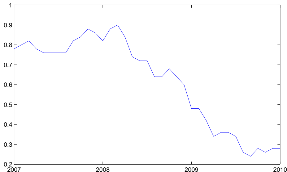
Figure 5.1: Relative rejection rates from 2007:01 to 2009:12

casts, including pre-selection of the predictors (Bai and Ng, 2008a) and boosting (Bai and Ng, 2009), among others. We pre-select 55 variables using the elasticity net, which is known as an effective tool to perform variable selection and shrinkage simultaneously (Bai and Ng, 2008a).